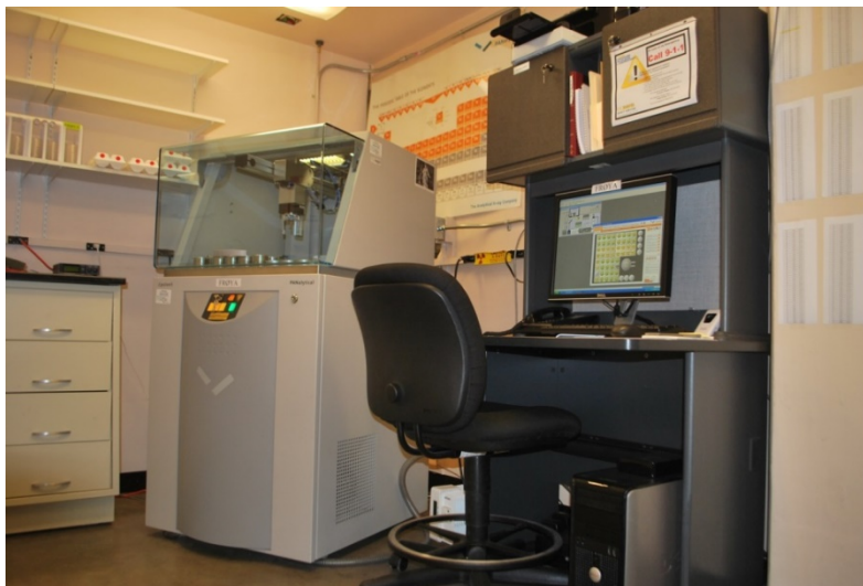
Figure 1. PANalytical Epsilon 5 analyzer and computer station in the XRF Laboratory at AQRC.