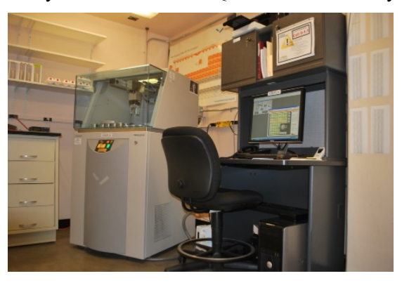
Figure 1. PANalytical Epsilon 5 analyzer station in the AQRC XRF Laboratory.