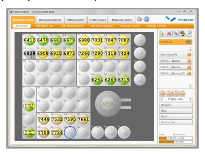
Figure 4. Status of sample analysis differentiated by color code.

The samples loaded in the sample changer compartment correspond with the empty Petri slides located in the Petri slide holder (Figure 5). Each Petri slide holder is labeled with the instrument name (e.g., Odin). Each compartment is labeled with a letter that represents one of the XRF sample trays (A-F, S). Petri slides do not stack perfectly into