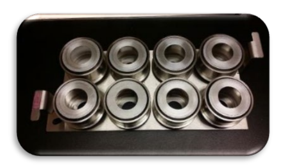
Figure 7. Tray with analyzed samples.