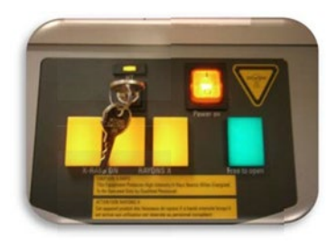
Figure 6. Green "Free to Open" light.

1) Sample changes can be made while the instrument is analyzing as long as the green Free to Open light is illuminated (Figure 6).