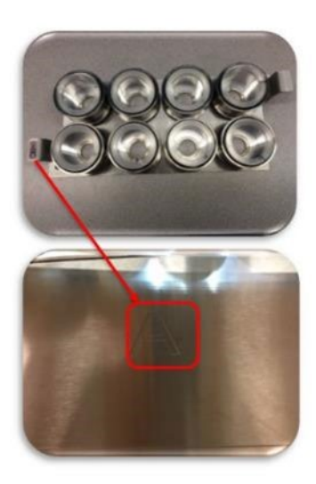
Figure 3. Letter on Tray handle matches etched letter on the instrument table.

The Epsilon 5 software displays the configuration of the trays in the compartment. The individual samples are color coded based on the analysis status (Figure 4):