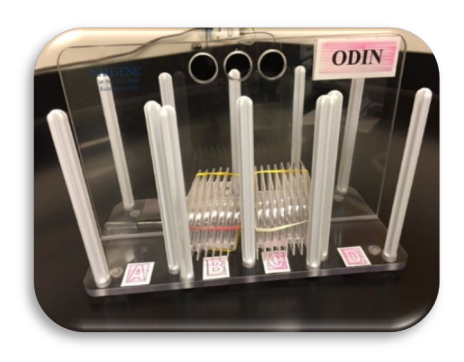
Figure 5. Petri slide holder.

the holders; wrap the Petri slides with rubber bands and place in the correct compartment (the barcode labels may be placed on the top or bottom of the Petri slide).