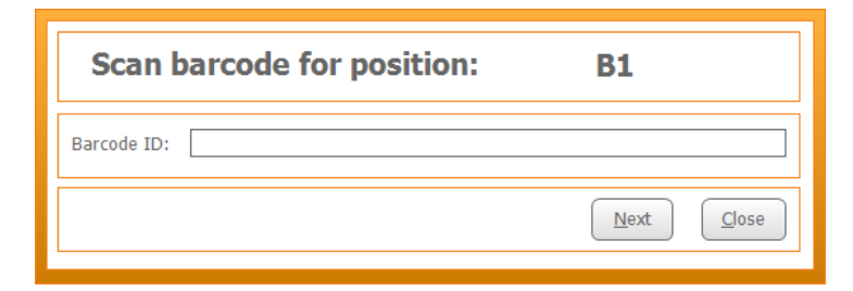
Figure 11. Scan barcode window.

Scan or type the Barcode ID, and the Sample ID will show up in the sample changer