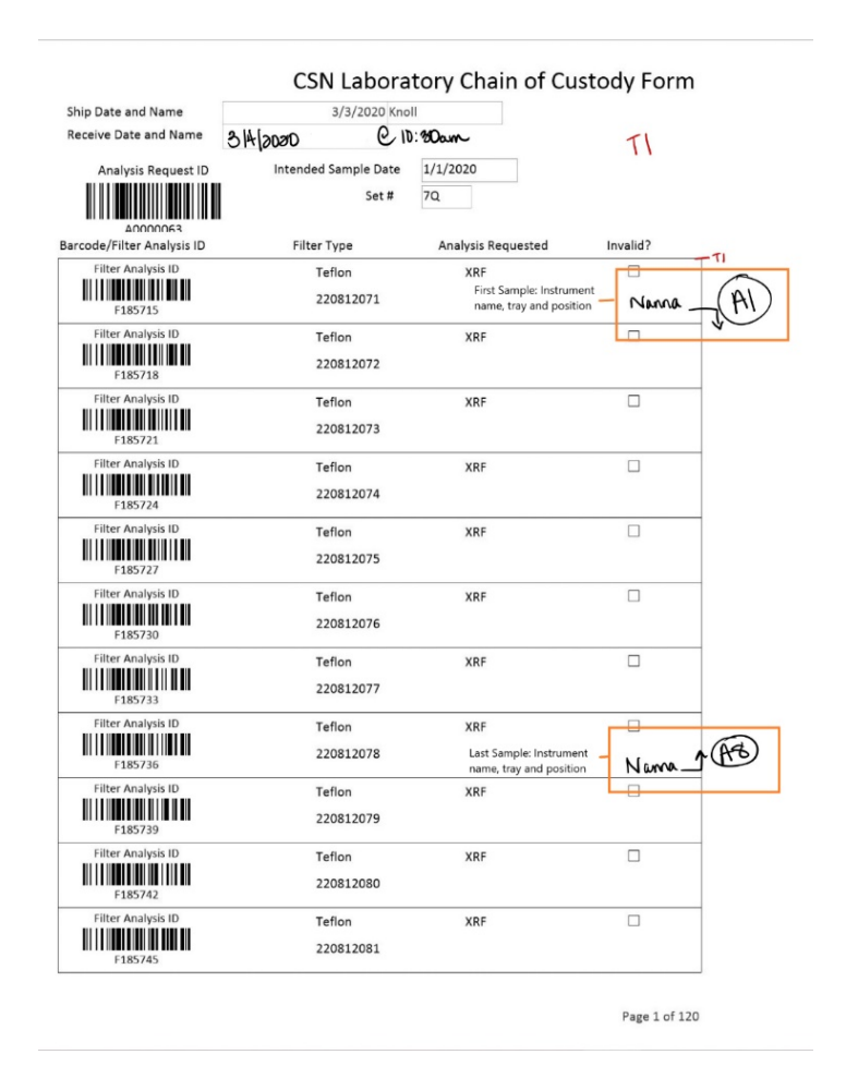
Figure 10. Chain of Custody form includes the samples' assigned instrument name, tray, and position number.

Select the tray and position where the first samples will be loaded. For example: Tray B position 1 (B1). Highlight the Handheld button. The button will turn orange and the Scan barcode for position: B1 window will open (Figure 11).